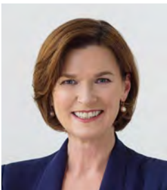
The Hon Mary-Anne Thomas MP Minister for Agriculture

I am looking forward to working with key partners to implement this plan, continuing to strengthen and build on the 2016 - 2020 Plan to ensure safe, sustainable and responsible hunting into the future.